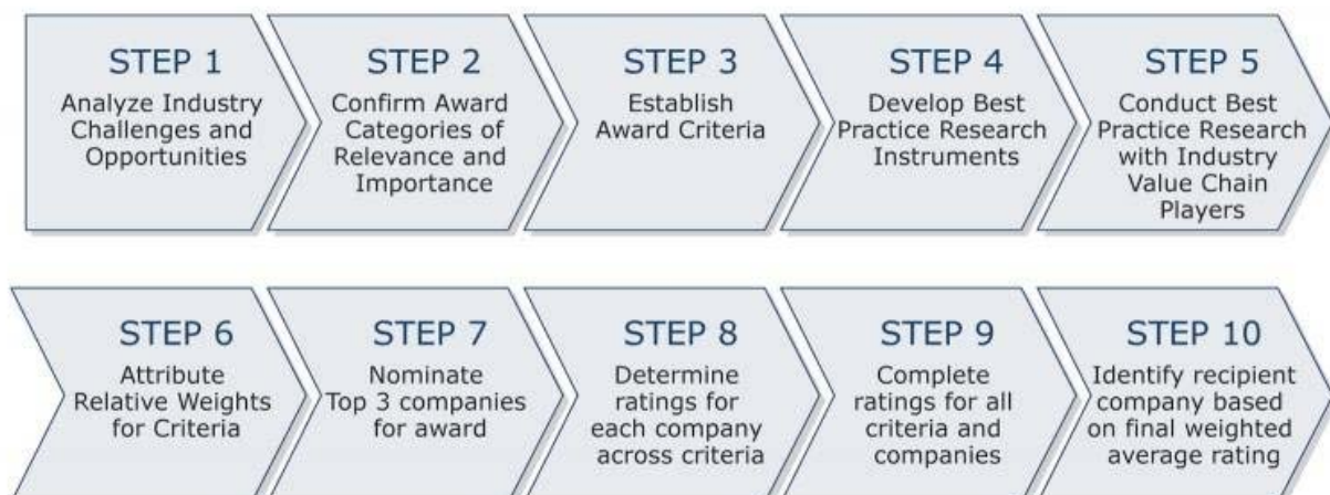
Chart 3: Frost & Sullivan's 10-Step Process for Identifying Award Recipients

This exercise encompasses all criteria, leading to a weighted average ranking of each company. Researchers can then easily identify the company with the highest ranking. As a final step, the research team confirms the veracity of the model by ensuring that small changes to the ratings for a specific criterion do not lead to a significant change in the overall relative rankings of the companies.