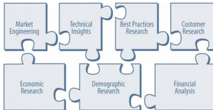
Chart 6: Benchmarking Performance with TEAM Research

Integration of these research disciplines into the TEAM Research methodology provides an evaluation platform for benchmarking industry players and for creating high-potential growth strategies for our clients.